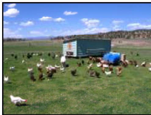
Chicken Tractor at Fox Fire Farms

For more information, please email: juliehudak@gmail.com